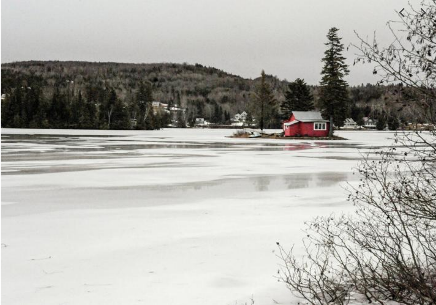
Joe's Pond, thinly covered by ice, is shown on Jan. 5, 2023.