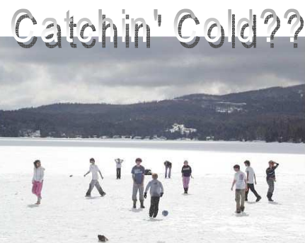
Soccer Game On Joe's Pond~ Sunday March 25, 2007~