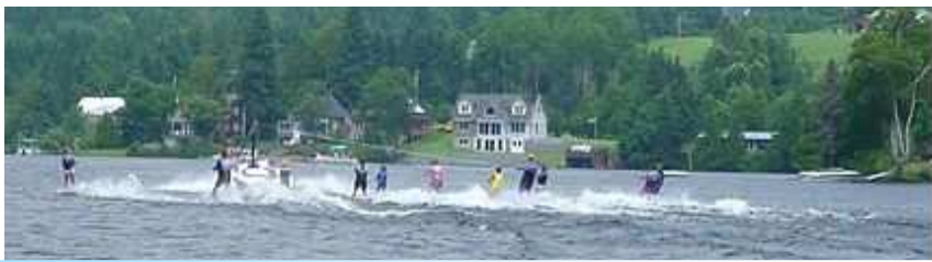
July 17, 2005 ~~~ This has gotta be a record for Joe's Pond!! 11 Skiers ~ One boat!