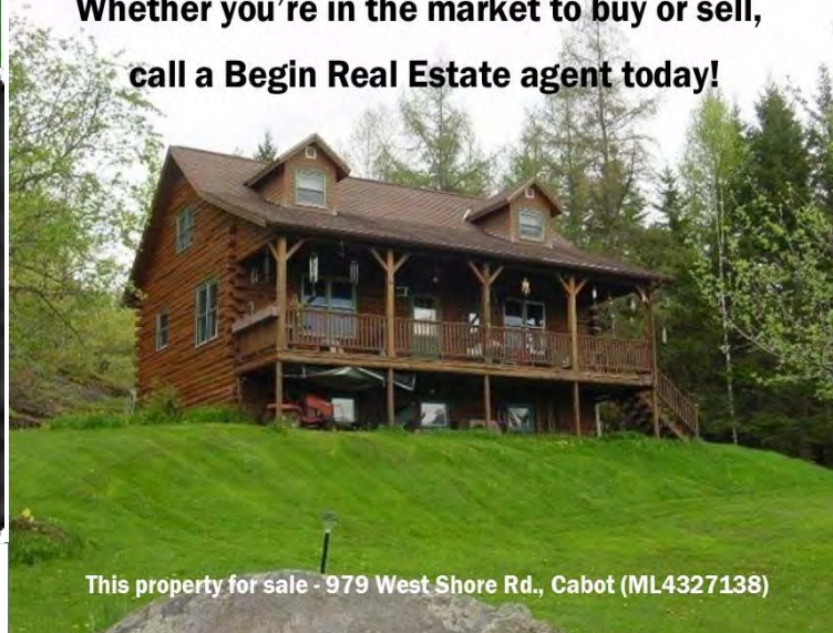
This property for sale - 979 West Shore Rd., Cabot (ML4327138)

Whether you're in the market to buy or sell, call a Begin Real Estate agent today!