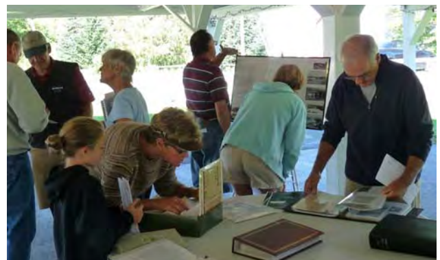
End of year meeting, August 24, 2014